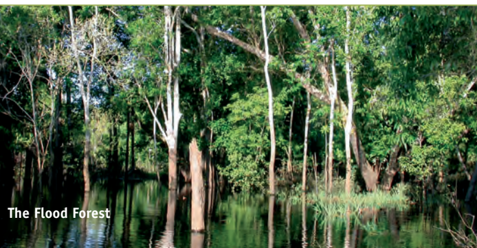
The Flood Forest

»Juma Lake Inn, a very special experience!«